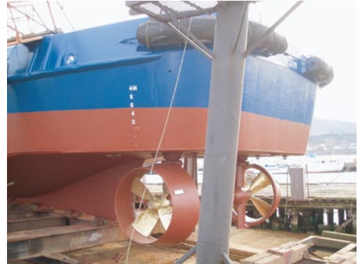
A view of the overhauled "Schottel" propulsion units prior to re-launching of the vessel.